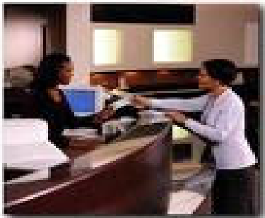
Bank Skills Training